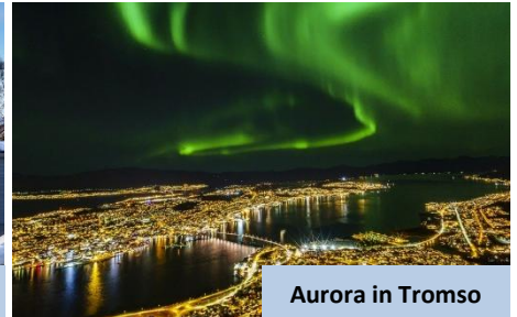
Aurora in Tromso