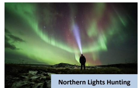
Northern Lights Hunting