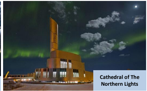
Cathedral of The Northern Lights