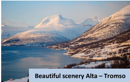
Beautiful scenery Alta – Tromso

NOTE: The northern lights are a natural phenomenon hence they cannot be guaranteed nor surely forecast.