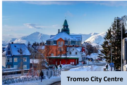
Tromso City Centre