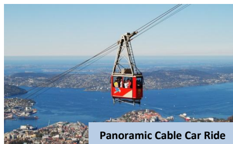
Panoramic Cable Car Ride