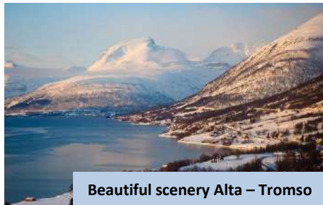
Beautiful scenery Alta – Tromso

NOTE: The northern lights are a natural phenomenon hence they cannot be guaranteed nor surely forecast.