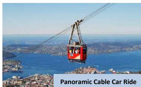
Panoramic Cable Car Ride