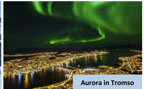
Aurora in Tromso