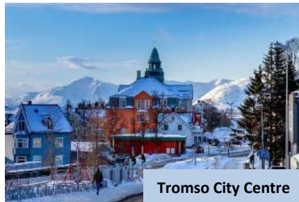
Tromso City Centre