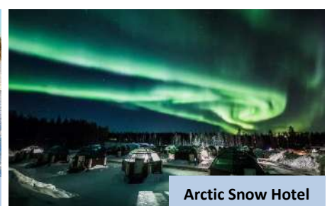
Arctic Snow Hotel